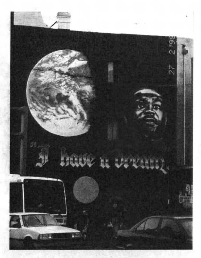
Figure 1.1 Aboriginal inscription, Sydney

Clearly for people living outside of conventional norms, such as gays or single women, or for those seeking to break the bonds of earlier ties, the city can represent a space of liberation. A different fantasy comes into play for many intercountry migrants or rural—urban migrants leaving an impoverished rural life where agricultural opportunities have been stripped away, who may see the city as a potential source of livelihood and a better life. The fact that many such migrants end up living in the poor areas of the American, British, or European city or ramshackle dwellings on the sidewalks of Johannesburg, does not dilute the force of the imagined advantages of the city to those who follow.