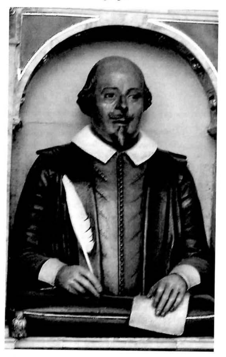
Figure 7. Shakespeare monument with bust and inscription (inscription appears beneath) at Holy Trinity Church, Stratford-upon-Avon.

The inscription beneath the bust divides in two, the first part in Latin, the second a six-line verse in English couplets: