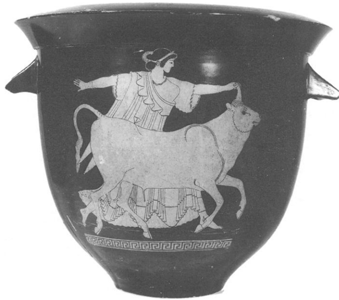
Figure 11. Bell krater by the Berlin Painter (Tarquinia RC 7456). Europe running alongside of Zeus.

and eager to touch and embrace him. 59 She does not hesitate to climb on his back. 60