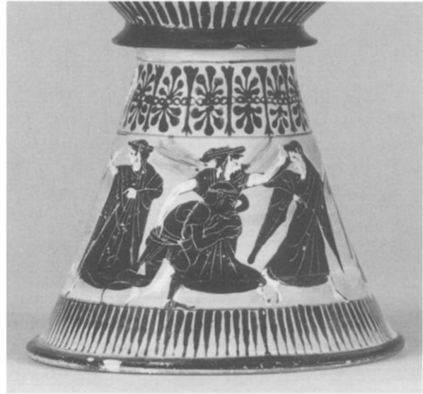
Figure 13 ( above ). Lebes gamikos (British Museum B 298 [XXXIX-C13]). Peleus holding Thetis.

Even though his wedding to Thetis was the high point of Peleus's life, his goddess wife Thetis was miserable in the marriage ( Il. 18.430–435), and soon left him. His son Achilles was the greatest Greek hero, but he died at Troy.