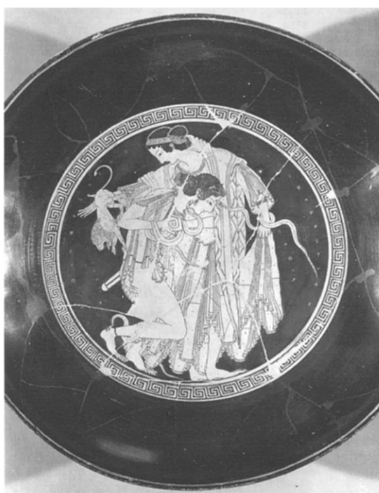
Figure 14. Kylix by Peithinos (Berlin F 2279). Sides A–B: couples courting and embracing; tondo: Peleus holding Thetis.