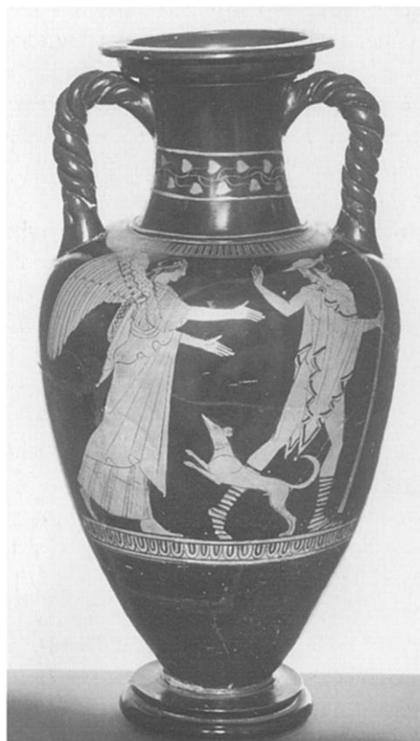
Figure 1. Neck amphora by the Nausicaa Painter (Berlin F 2352). Eos approaching Kephalos.