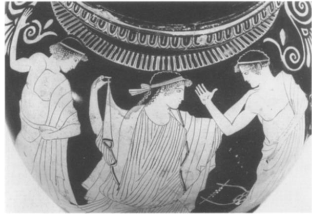
Figure 2 (left). Bell krater by the Christie Painter (Baltimore Museum of Art 1951.486). Eos approaching Kephalos. Courtesy Baltimore Museum of Art, bequest of Sadie A. May