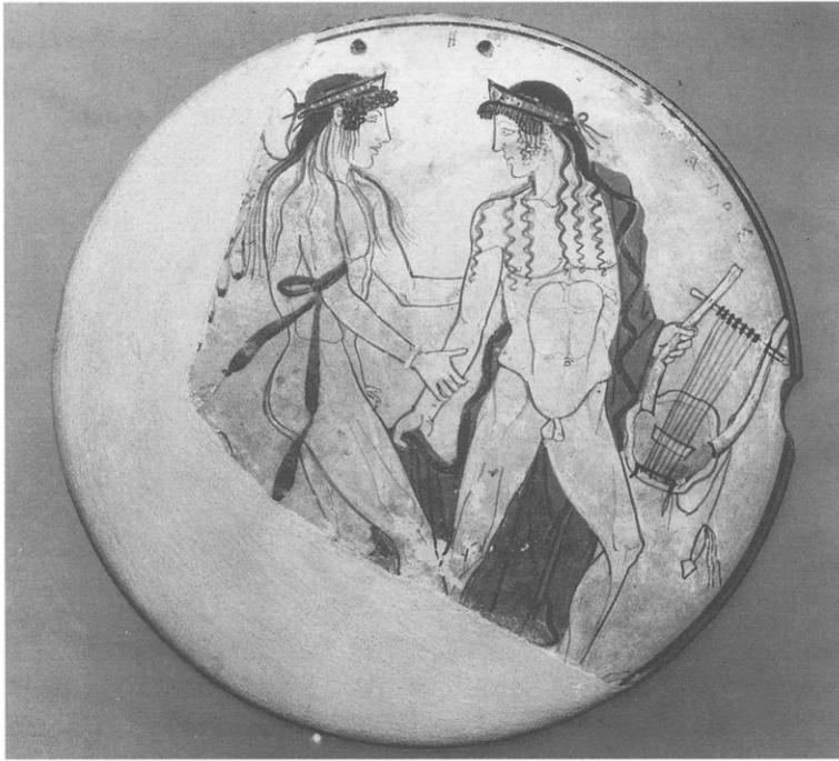
Figure 5 (left). Polychrome bobbin by the Penthesilea Painter (New York 28.167). Zephyros taking hold of Hyakinthos.