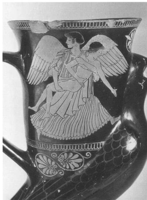
Figure 8 (left). Lekythos by the Oionokles Painter (Madrid 11158). Eos carrying off Kephalos.