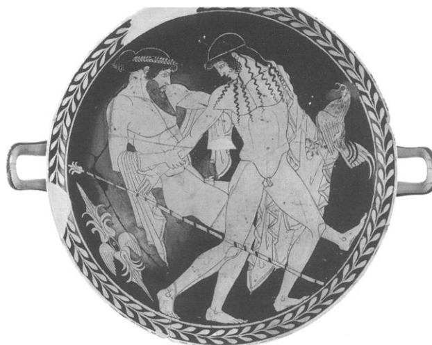
Figure 7 (above, right). Kylix by the Penthesilea Painter (Ferrara 9351). Zeus taking hold of Ganymedes.

to use both deception and violence to abduct Persephone, because she, like himself, is a divinity, powerful, immortal, and ageless. As the story is related in the Homeric Hymn to Demeter , Zeus tells Gaia to produce an intoxicating narcissus, which Persephone wants to pick; Hades then takes her by surprise, by making the earth open beneath her feet, as he rushes out to carry her off on his chariot ( Hymn. Hom. 2.8–18). 41