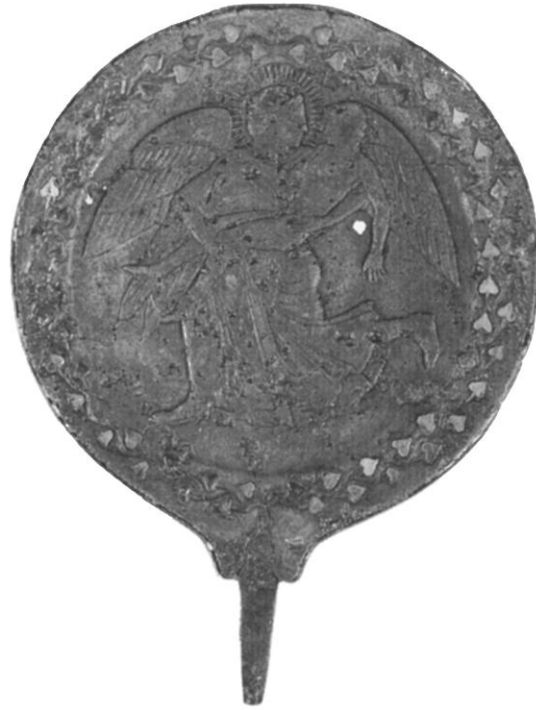
Figure 10. Etruscan bronze and silver mirror (Vatican 12241). Thesan (Eos) carrying off Kephalos.

status. 47 There are no inscriptions or literary documents that suggest that Athenians in the 5th century attached a happy ending to any of the Eos myths. They buried the dead just before dawn, for practical reasons, not because they supposed the goddess would be there to carry the soul away. 48 For them a benevolent winged Charon represented a good and easy death. 49 At best, scenes of Eos on funerary lekythoi might have conveyed to mourners a vague hope that the deceased, like the heroes of old, might find himself in a brighter place in the lower world. 50 It is only in later antiquity that abductions by goddesses were used to suggest a mode of death and a promise of a future existence in the light, nearer to the gods. 51