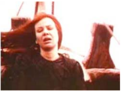
Click for larger view View full resolution

William Connolly is one of a number of political theorists who have found in tragedy a resource for a critique of the contemporary condition. In Capitalism and Christianity, American Style , he calls for the adoption of a certain tragic vision: "A tragic drama by Sophocles concentrates a tragic result into a play. A tragic vision builds such a set of possibilities into its fundamental conception of being. You approach a tragic vision if you doubt the providential image of time, reject the compensatory idea that humans can master all the forces that impinge upon life, strive to cultivate wisdom about a world that is neither designed for your benefit nor plastic enough to be putty in your hands, and cultivate temporal sensitivity to how this or that concatenation of events could issue in the worst."<sup>39</sup>