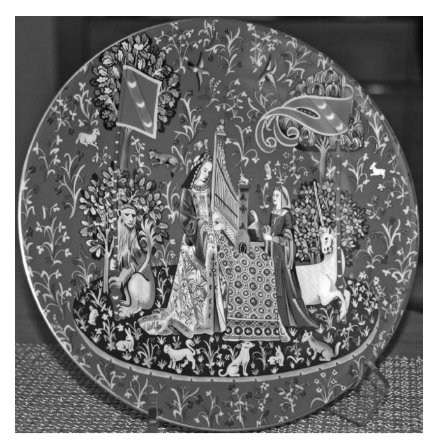
Figure 2. Haviland plate reproducing the image of the allegory of hearing from the Lady and the Unicorn series of tapestries at the Cluny Museum, Paris. Von Trier's image of Medea at the outdoor loom (figure 1) recalls the Lady sitting at her portable organ with all the beasts listening to her peacefully; in the same position as the Lady's handmaiden, Jason turns away from Medea, destroying a moment of harmony with nature. Collection of Susan Joseph; photograph by Daniel Joseph.

under the Yoke as found in a 1709 English edition of Cesar Ripa's handbook Iconologia (figure 3). Hitched to a wooden cart, Medea drags her sleeping children across a wheat field (scene 19). On the horizon is the tree where she will hang them, as predicted by the logo of the film. The older child is her accomplice. He catches his little brother and helps his mother kill him, and then offers her the rope for himself. What more compelling image of the fertile earth gone wrong?