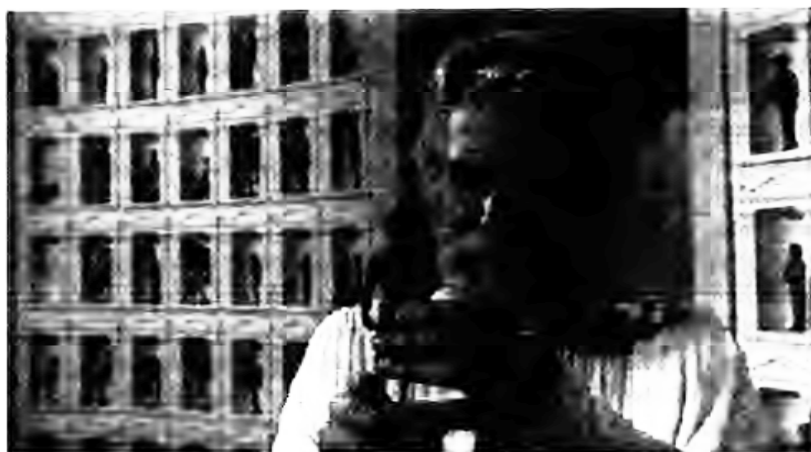
Figure 17.1 Zeus (Laurence Olivier) holds the figurine of Perseus in Clash of the Titans (1981). Metro-Goldwyn-Mayer.

Her words are heard partly in voice-over as the real-life Perseus beds down on Seriphos. In a high-angle close-up, the youth lies on his back and gazes at the sky. The full moon, seen in a reverse low-angle shot, dissolves into Thetis, momentarily framed within its orb. "Far to the east, across the sea, in Joppa," she decrees, turning the figurine onto its back and lowering it off screen into the arena. In a ground-level composite shot of the theater at