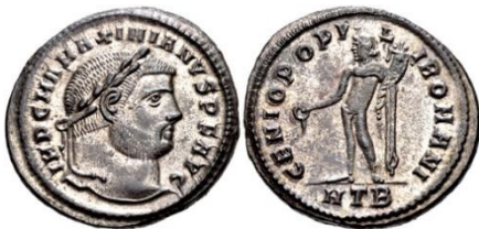
Fig. 2. Nummus Maximianus (28mm, 10.22 g). Heraclea mint, RIC VI 19b.

The nummus was in fact the pivot of the tetrarchic currency system and it circulated in the entire Roman Empire. As neither aureus nor argenteus were in fact available for payments, folles or sealed and standardized bags of nummi were probably used for large payments. See Kropff, A. 2017. Diocletian's Currency System after 1 September 301 AD: an inquiry into values. Revue Belge de Numismatique et de Sigillographie 163, p. 167-187.